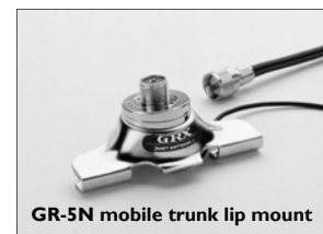
GR-5N mobile trunk lip mount