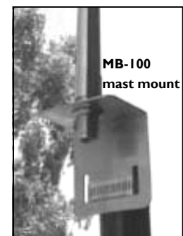
MB-100 mast mount