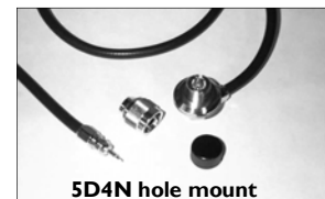
5D4N hole mount