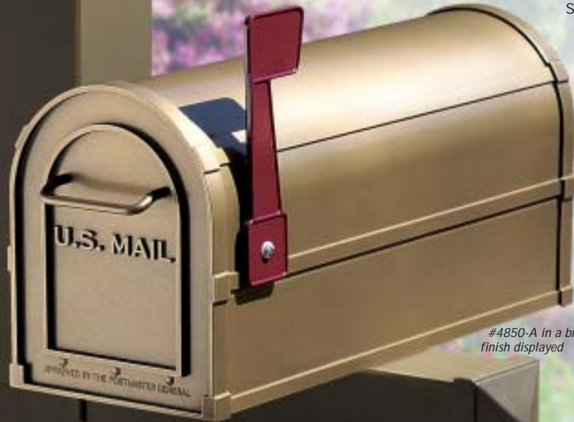
#4850-A in a brass finish displayed

Salsbury U.S.P.S. approved 4800 series antique rural mailboxes are available in a durable antique brass or antique bronze powder coated finish. These mailboxes provide an antique look that adds elegance to any home. Each antique rural mailbox features a 1/8" thick extruded aluminum body and a 1/8" thick die cast aluminum front door and rear cover. Each mailbox also includes a magnetic door catch and an adjustable burgundy signal flag. See additional specifications on page 41. Antique rural mailboxes can be mounted on classic posts (#4890-A, #4891-A and #4892-A), standard posts (#4865-A and #4895-A), decorative posts (#4825-A and #4826-A), deluxe posts (#4870-A and #4880-A) or a base of your choice. All aluminum posts feature a durable antique bronze powder coated finish. Multiple antique rural mailboxes can be mounted on the classic and deluxe 2-sided posts or on the standard and decorative posts using optional spreaders. Antique rural mailboxes are approved for U.S.P.S. curbside mail delivery.