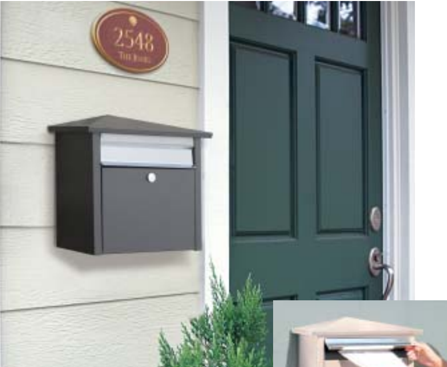
#4750 and custom plaque (#1430) (see pages 66-69) displayed