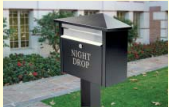
#4750 on standard post (#4795) with custom numbers / letters (see page 71) displayed