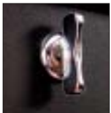
optional thumb latch displayed (#4788 - $10.00)