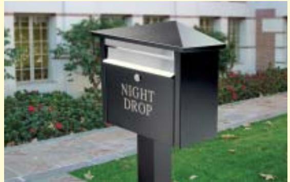
#4750 on standard post (#4795) with custom numbers / letters (see page 71) displayed