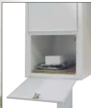
Rear view of #4375 displayed