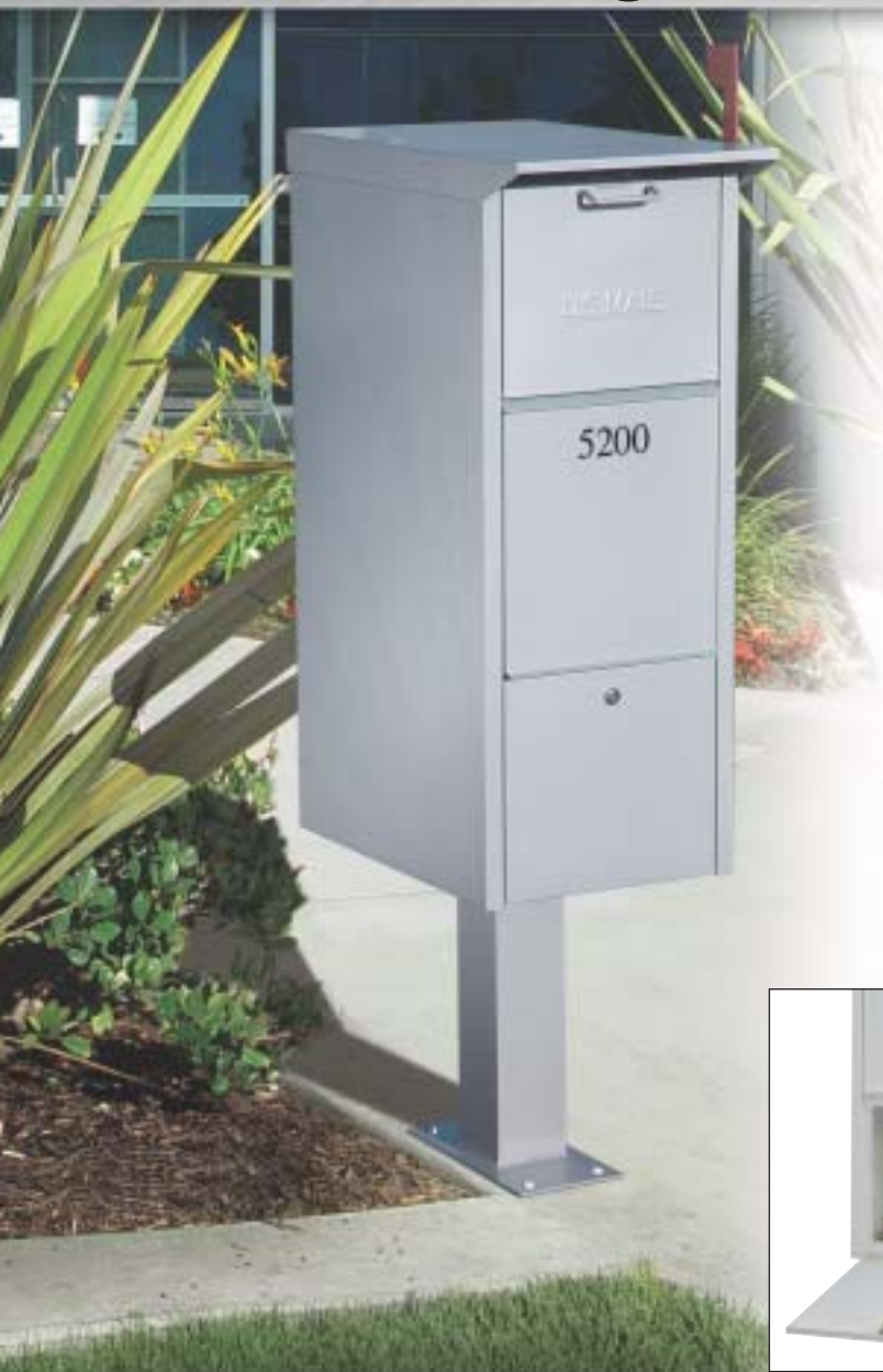
#4375 attached to bolt mounted pedestal (#4395) with custom numbers / letters (see page 71) displayed