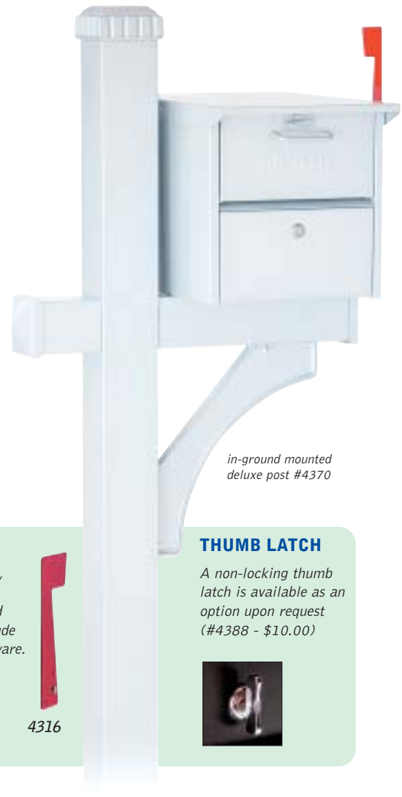
in-ground mounted deluxe post #4370