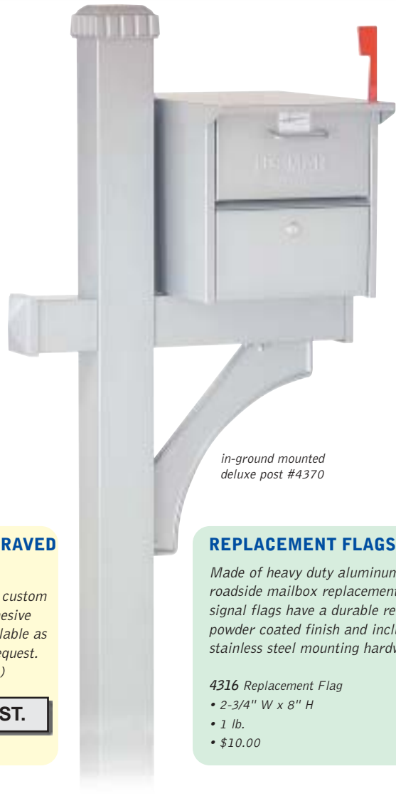
in-ground mounted deluxe post #4370