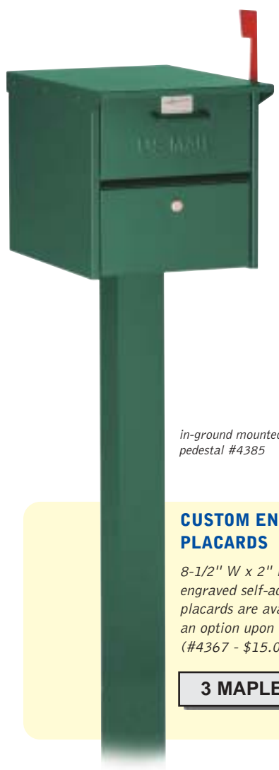
in-ground mounted pedestal #4385