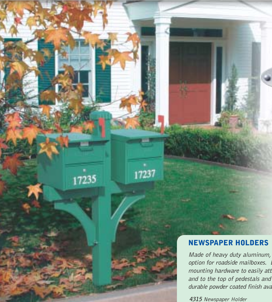
(2) #4325's on a 2-sided deluxe post (#4372) with custom numbers / letters (see page 71) displayed