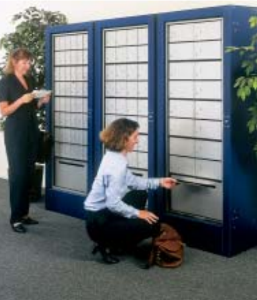
order mailboxes separately

Constructed of 16 gauge steel, 3100 series Rotary Mail Centers feature a vinyl finish available in five (5) contemporary colors. Aluminum style Rotary Mail Centers (#3100) are designed to accommodate a combination of five (5) aluminum rack ladder system mailboxes and data distribution system boxes (see pages 16-19). Brass style Rotary Mail Centers (#3150) are designed to accommodate a combination of two (2) brass or Americana style rear loading mailbox units (see pages 20-23). To operate, the user unlocks the unit and rotates the inner cabinet 180 degrees so that the rear of the mailboxes are facing the front (see below). After distributing the mail, the inner cabinet is rotated back 180 degrees to the tenant access position. A matching rear cover (#3125) is available as an option upon request. Heavy duty Rotary Mail Centers are ideal in locations where a secure and professional mailbox system is desired.