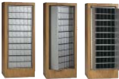
Inner cabinet rotates 180 degrees for mail distribution