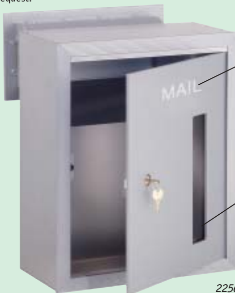
2256 Receptacle with mail drop (#2255) displayed

order mail drops and receptacles separately