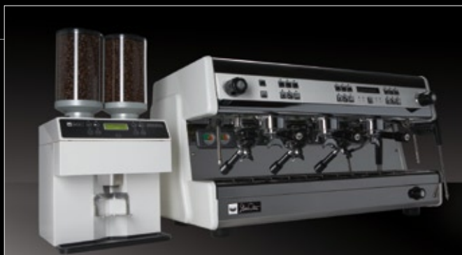
Evolution + Grinder DCII