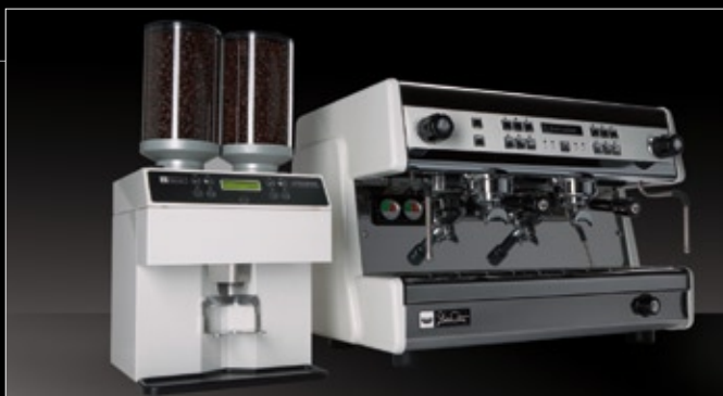
Evolution + Grinder DCII